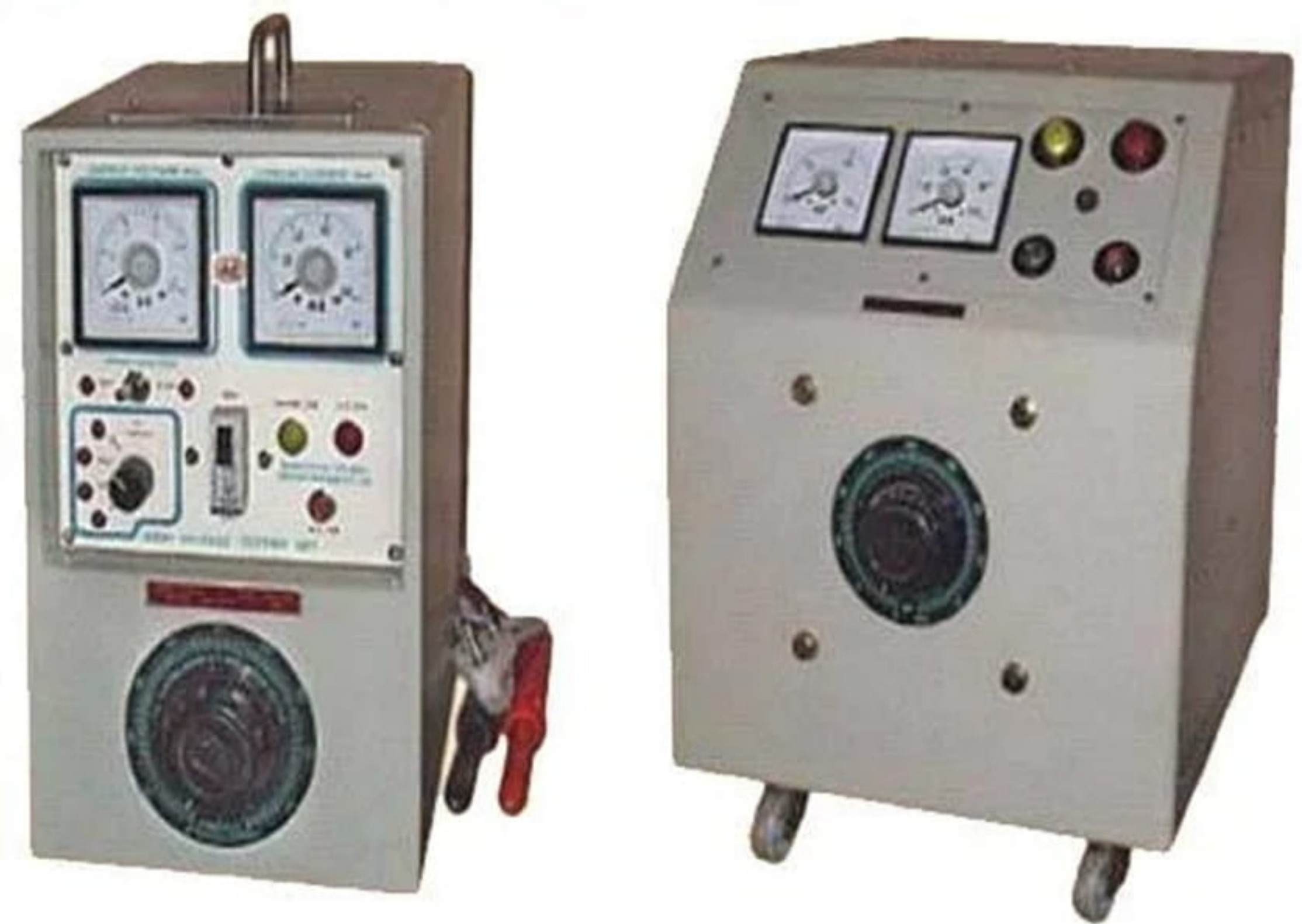
High Voltage Test Kit