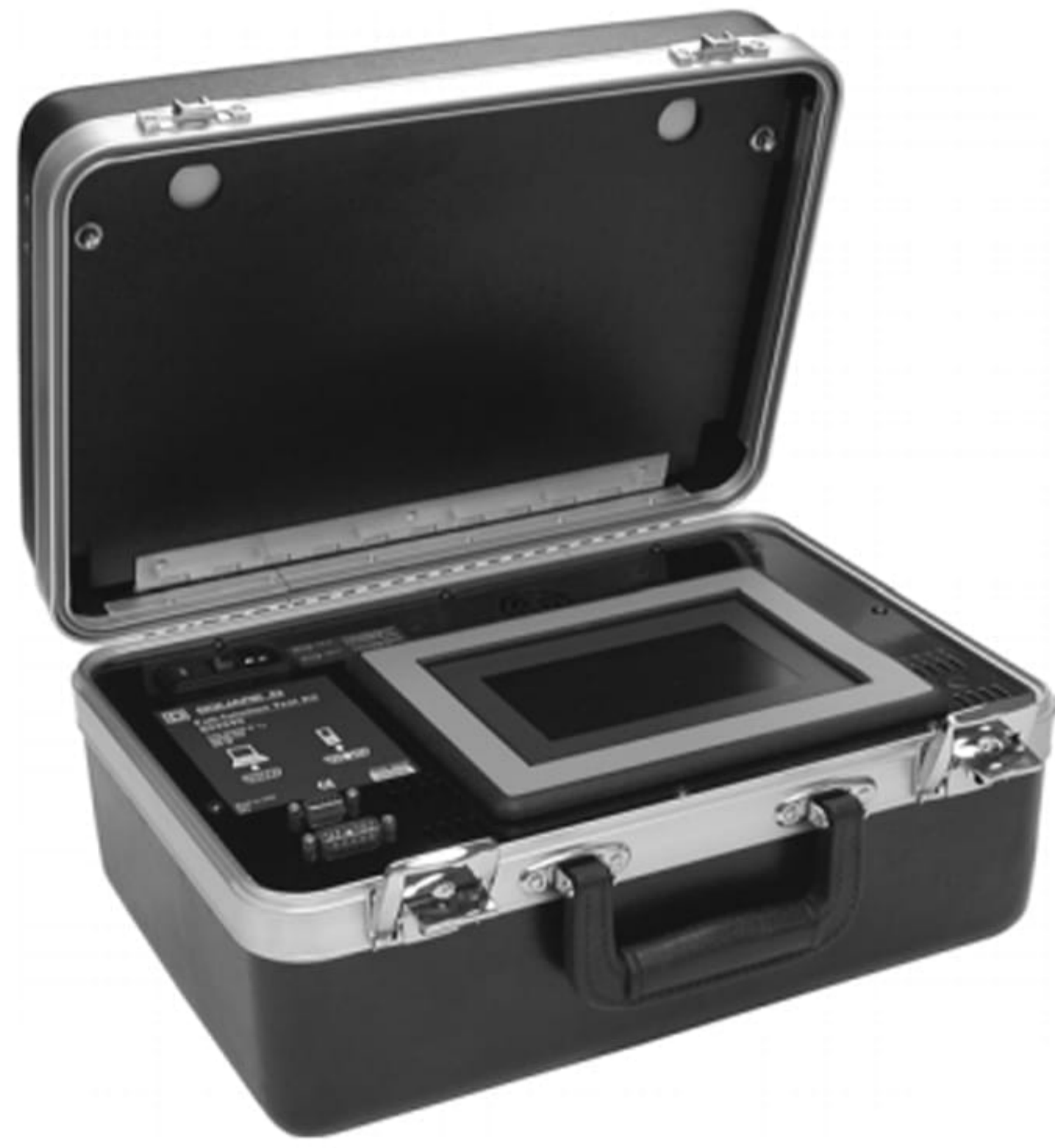
ACB Testing Kit