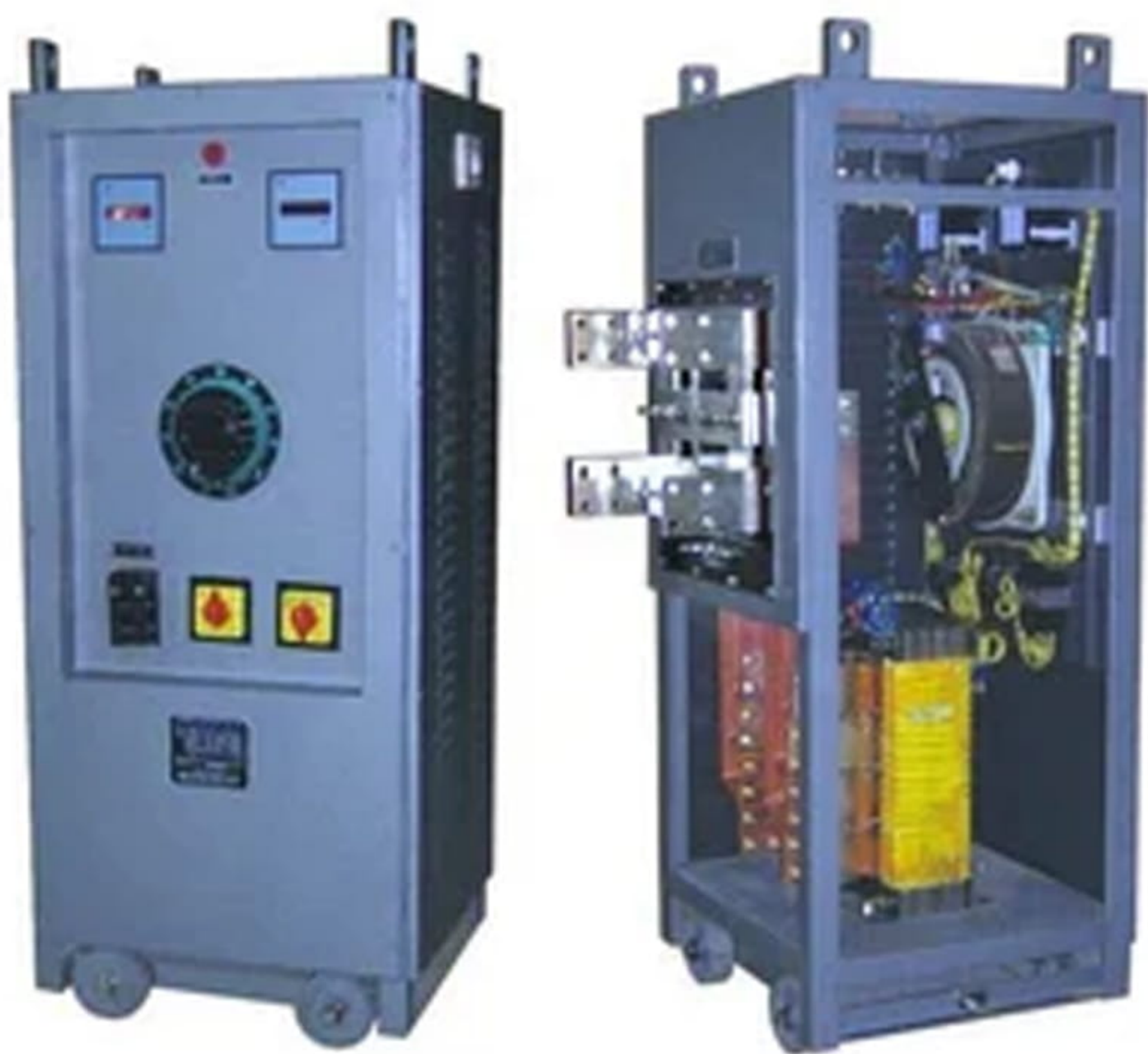
Primary Injection Test Kit